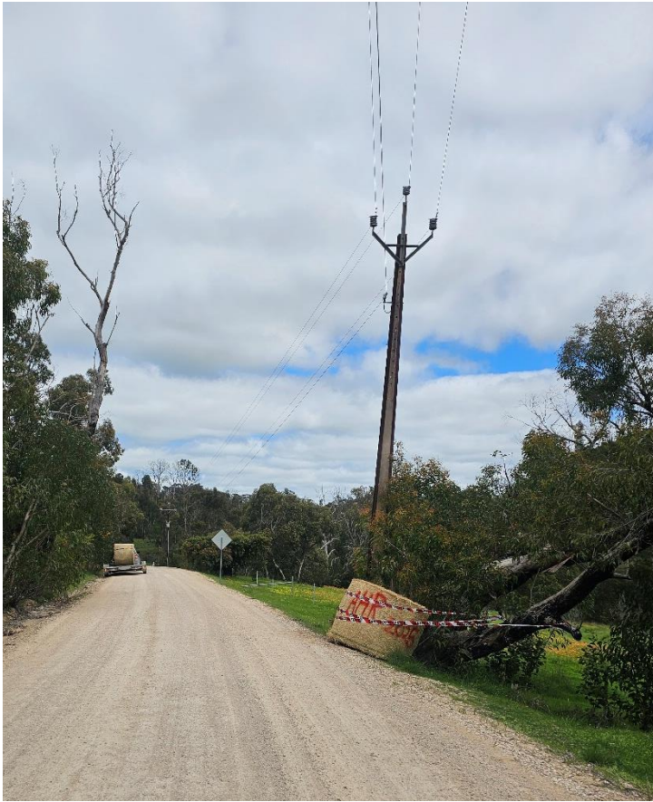
Clarendon SS11 & SS13, on exit of tulip 3