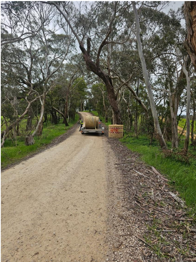
Kuitpo SS 12 & 14, On the exit of tulip 29